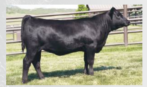
Spruce Mtn Lady 4008 Maternal Sister to EXAR Triple PlAAAy 3763B