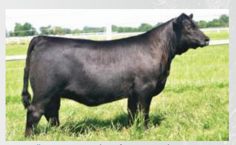
EXAR Elba 3611 »» Daughter of EXAR Cover The Bases 0819B