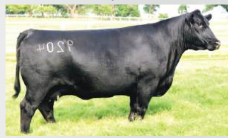
RSA Forever Lady 9204 »» Dam of RSA True Balance 1311