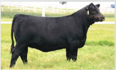
EXAR Isabel 4612 »» Daughter of EXAR Cover The Bases 0819E