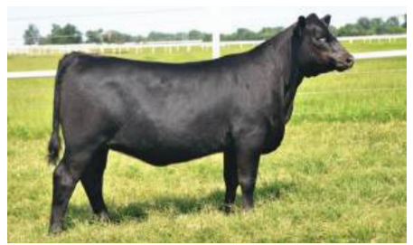
EXAR Elba 3682 »» Maternal Sister to EXAR Bedlam 2936B