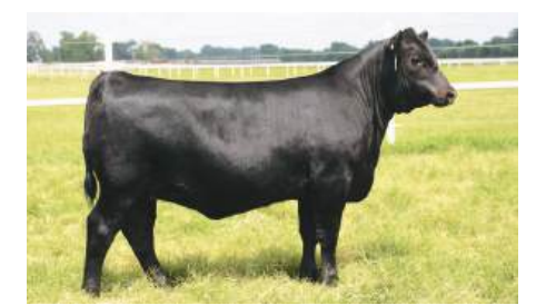
EXAR Lucy 4614 »» Daughter of RSA True Balance 1311