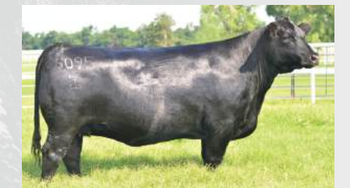
Chair Rock Sure Fire 6095 »» Dam of EXAR Tomahawk 2836B

half-interest selection of Pollard Farms; and Linda 1601, the $170,000 co-top-selling open heifer of the 2022 Spruce Mountain Ranch Sale selected by AAA Farms; a flush selling to Vintage Angus Ranch in the 2021 Express Ranches Sale for $150,000; Linda 1884, the $130,000 selection of Riverbend Ranch in the 2022 Express Ranches Big Event; a $60,000 top-selling heifer pregnancy in the 2021 Bases Loaded Sale selected by AAA Farms; and a $40,000 heifer pregnancy selected by RS Angus in the record-setting 2023 Big Event.