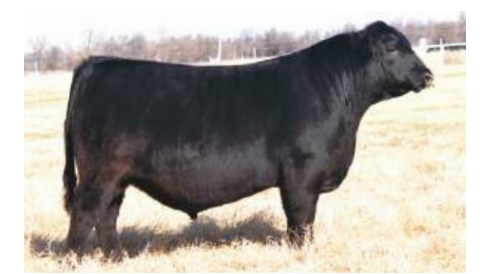
EXAR Closer 3646B »» Son of EXAR Cover The Bases 0819B