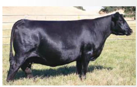
RMRK Rita 8232 »» Grandam of FF Rito Ambitious