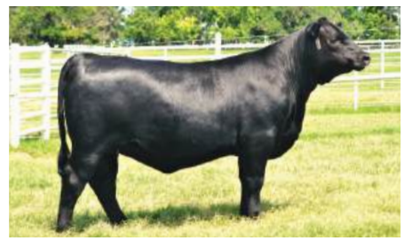
EXAR Linda 2851 »» Materna Sister to EXAR Tomahawk 2836B