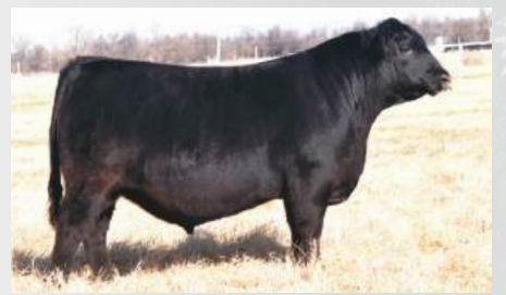
EXAR Closer 3646B »» Maternal Brother to EXAR Bedlam 2936