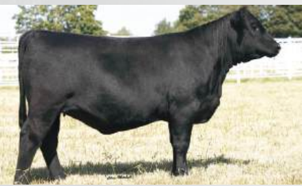
Deer Valley Linda 2739 »» Full Sib to EXAR Tomahawk 2836B