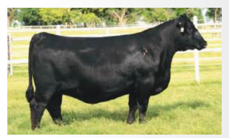
EXAR Elba 3645 »» Maternal Sister to EXAR Bedlam 2936B