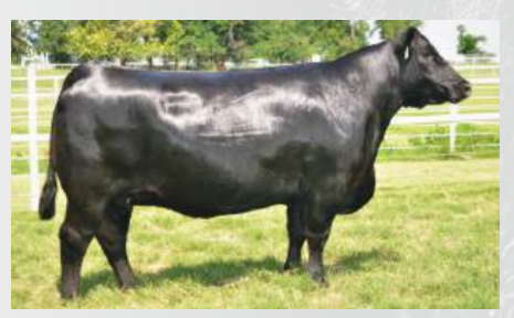
EXAR Elba 9501 »» Dam of EXAR Bedlam 2936B