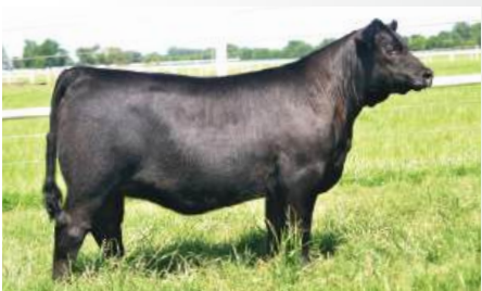
EXAR Elba 3611 »» Maternal Sister to EXAR Bedlam 2936B