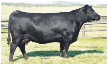
Spruce Mtn Lady 0549 \,\,\mathrm{sym} Dam of EXAR Triple PlAAAy 3763B