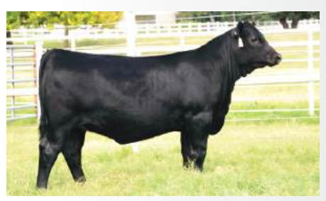
EXAR Lucy 4642 »» Daughter of RSA True Balance 1311