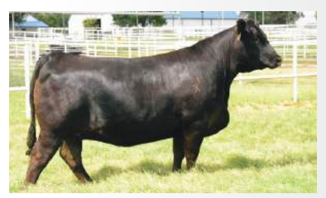
EXAR Blackcap 3012 »» Daughter of EXAR Cover The Bases 0819B