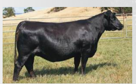
RMKR Rita 0237 »» Dam of FF Rito Ambitious