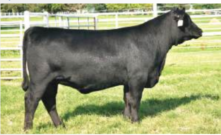
EXAR Linda 1884 »» Full Sib to EXAR Tomahawk 2836B