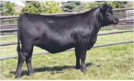
Spruce Mtn Lady 2307 Maternal Sister to EXAR Triple PIAAAy 3763B