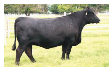
EXAR Elba 3604 »» Maternal Sister to EXAR Bedlam 2936B