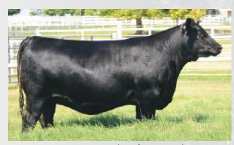
EXAR Erianna 3609 »» Daughter of RSA True Balance 1311