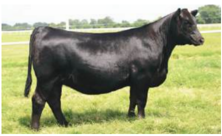
EXAR Evas 3830 »» Daughter of EXAR Cover The Bases 0819B