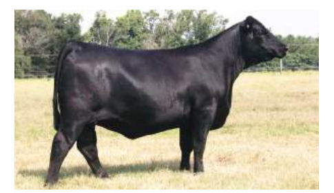
FF Rita 2B42 0237 Provider »» Maternal Sister to FF Rito Ambitious